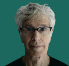
ANDREW N. LIVERIS AO