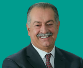
ANDREW N. LIVERIS AO